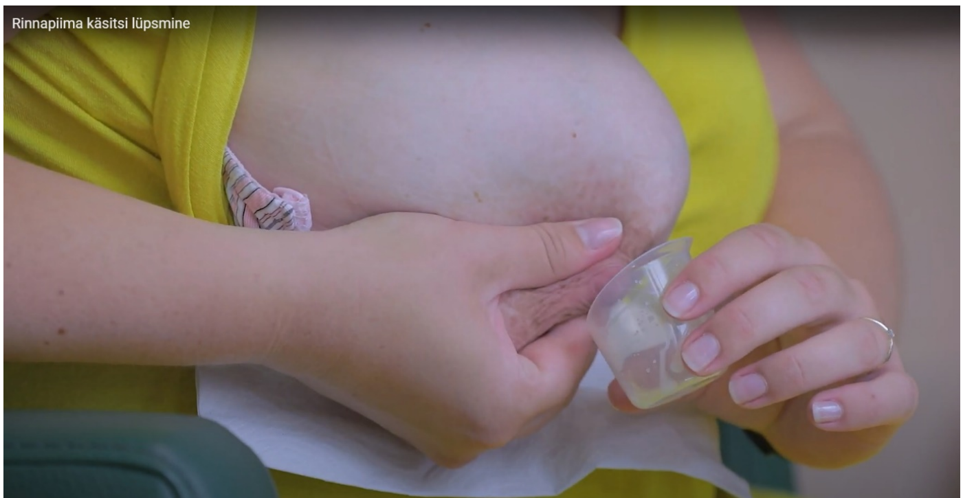
Figure 3. Hand expression of breast milk.

It may take a few minutes for the milk to flow, so be patient. After a while, change the position of your fingers on the breast to empty other milk ducts. Then move to the other breast and repeat the process.